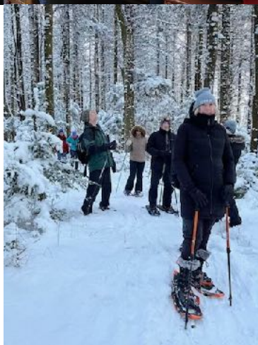
Bear Swamp Moonlight Hike January 21 12 people gathered to snowshoe in the crisp winter night.