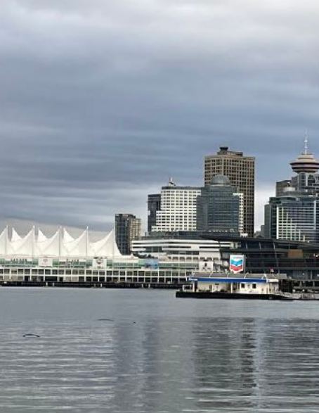
6 of 9